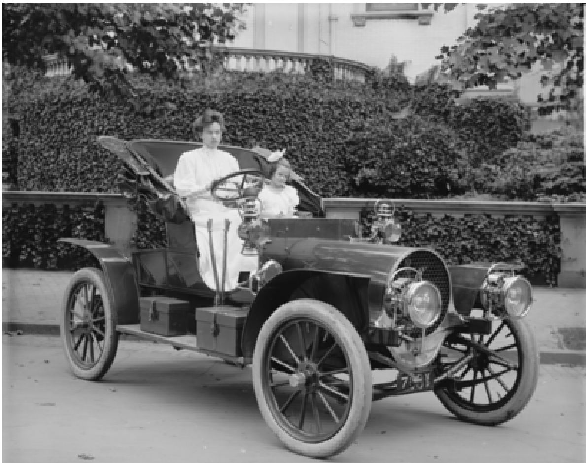
Figure 1: 1907 Franklin Model D roadster.